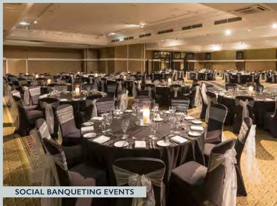
SOCIAL BANQUETING EVENTS

We can comfortably accommodate up to 700 delegates in a theatre set up and our central and accessible Manchester location and access makes us one of the most convenient conference venues in the city.